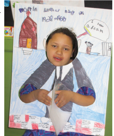
Defer student created Bio Buddies to present historical information in a fun way.